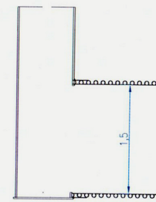
A A section detail